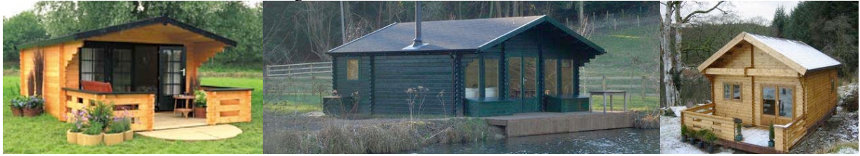
possible designs for log cabins