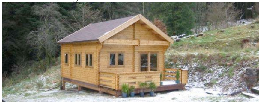
possible design for log cabin