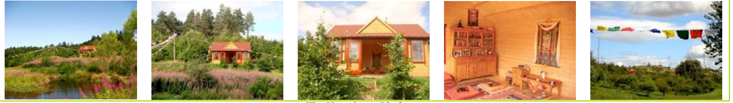
The Hermitage Lhakang